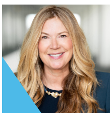
Kathi Vidal Director, US Patent and Trademark Office