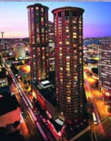
The Westin Seattle Hotel

Continuing legal education (CLE) credit is being requested in every state in which attendees are licensed to practice that has a mandatory CLE requirement. The number of credit hours will vary depending on the requirements of the individual state. IPO expects most states will award 12 to 14.5 credit hours for this program.