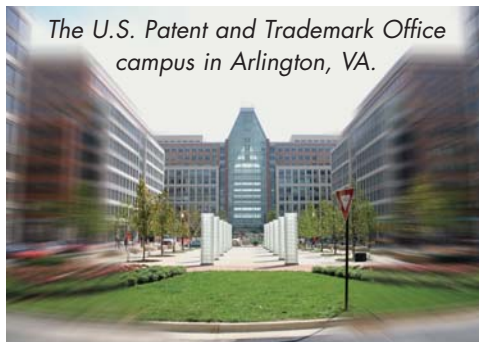
The U.S. Patent and Trademark Office campus in Arlington, VA.