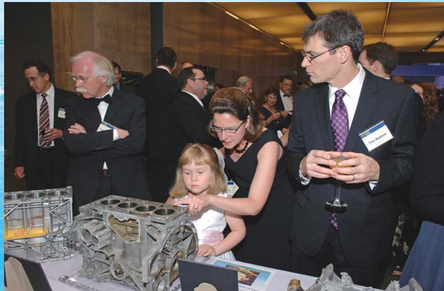
2009 Foundation Awards Dinner.

Intellectual property rights may be the least understood key to economic prosperity. IP rights encourage research, development, and commercialization of new and better products and services, leading to new jobs and new industries.