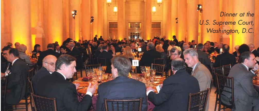
Dinner at the U.S. Supreme Court, Washington, D.C.

The 6th International Judges Conference will bring together as many as 100 internationally recognized judges, as well as intellectual property attorneys and other interested parties.