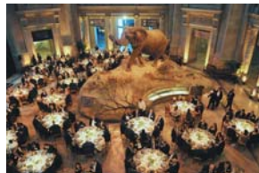
< 2010 Foundation Awards Dinner at the Smithsonian Museum of Natural History