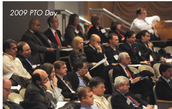
2009 PTO Day